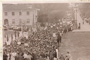
Pictured above, MLK-led march, Frankfort, 1964