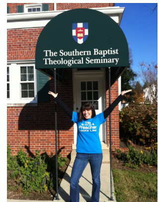
This is me standing outside the Southern Baptist Theological Seminary in a shirt that says, “This is What a Preacher Looks Like”

Their post reminded me of a time that I went to my old stomping grounds and created some holy mischief of my own.